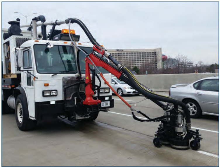
PAVEMENT MARKING REMOVAL